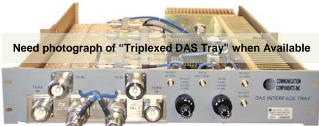
Need photograph of "Triplexed DAS Tray" when Available

CCI's Triplexed DAS Interface Tray provides an integrated, convenient, and single connection point when using multiple base